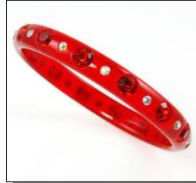
Red or Pink Bangle Bracelet