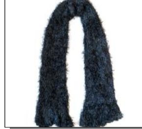
Black, Pink or White Magic Scarf