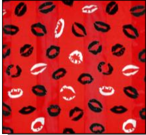
Black or Red Lip Scarf