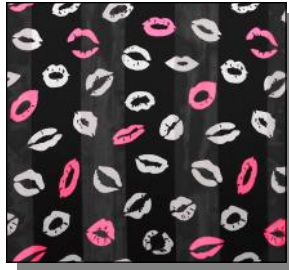
Black or Red Lip Scarf