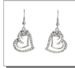
Austrian Crystal Earrings