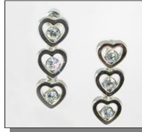
Tiffany Style Earrings