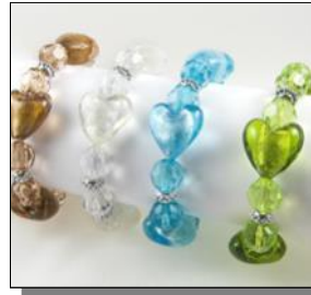
Moreno Heart Bracelet