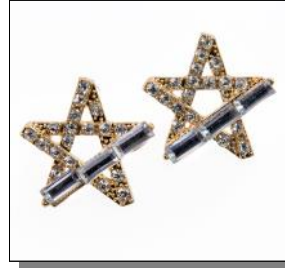
Crystal Star Earrings EA681