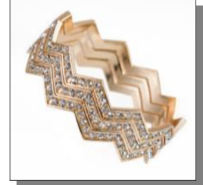
3-Piece Bracelet in Gold or Silver BR337