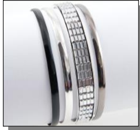
Bangle Bracelet in Gold or Silver BR278