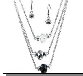
Fireball Crystal Necklace & Earring Set SNT250