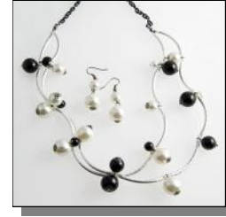
Black & Multi-Strand Pearl Necklace SN210