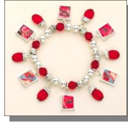
Silver & Red Lip Charm Bracelet BR142