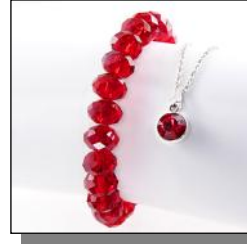
Austrian Crystal Beaded Bracelet & Necklace Set SNT235