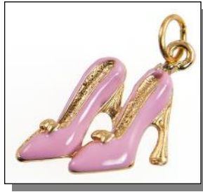
Pink High Heel Pendant or Charm CH265