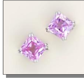
Stunning Pink CZ Earrings EA443