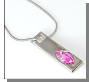
Designer CZ Pink Necklace NA205